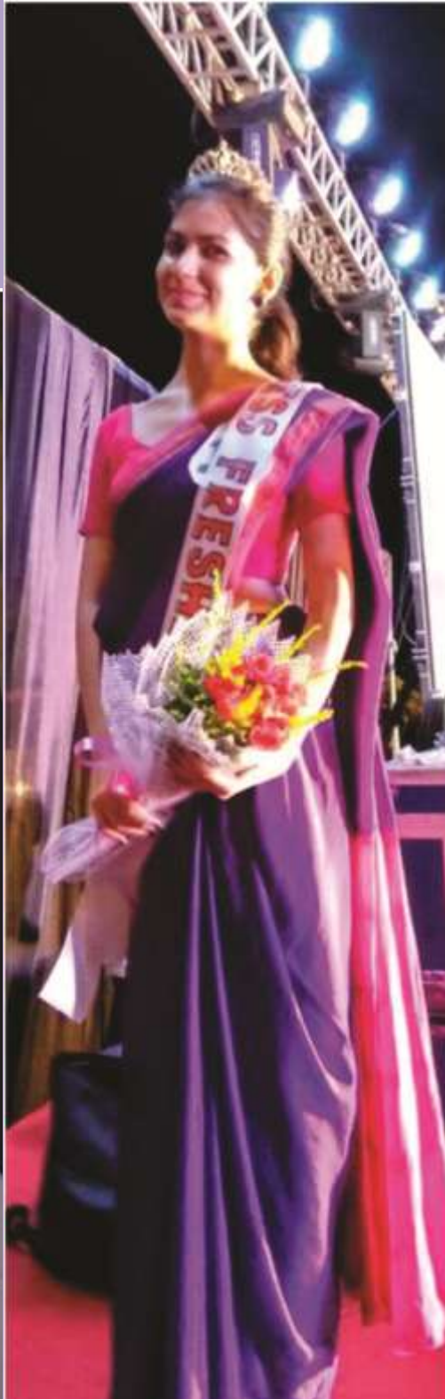
BEAUTY & BRAINS